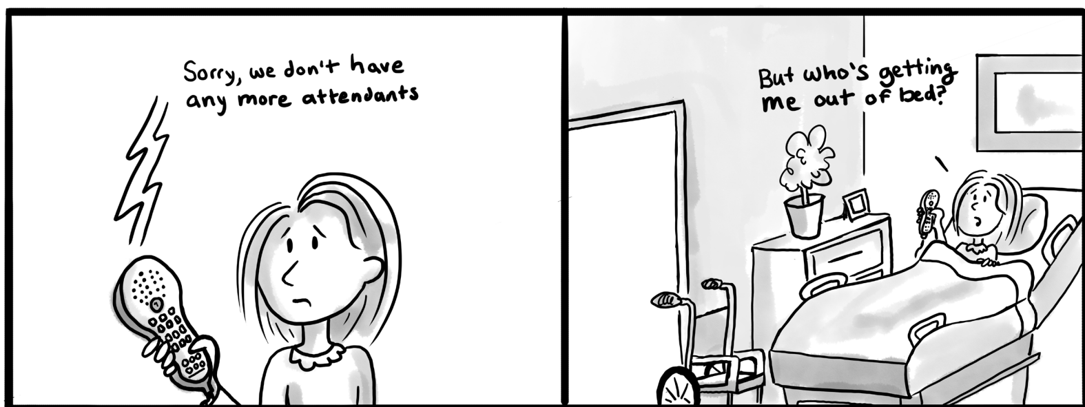
Crushing the Workforce 2.0 cover illustration