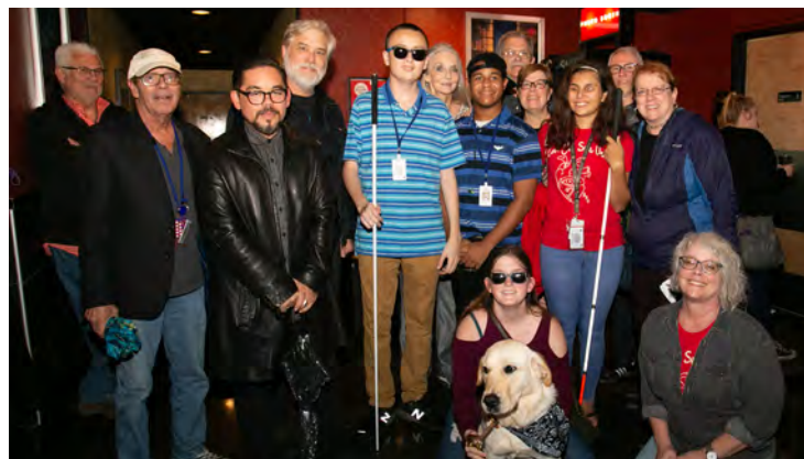
Students from the Texas School for the Blind and Visually Impaired attend the Fest to present their stop-motion short, The Purr-fect Dream.

Save the date: join us October 25 - 26, 2019 for the 16th year of Cinema Touching Disability!