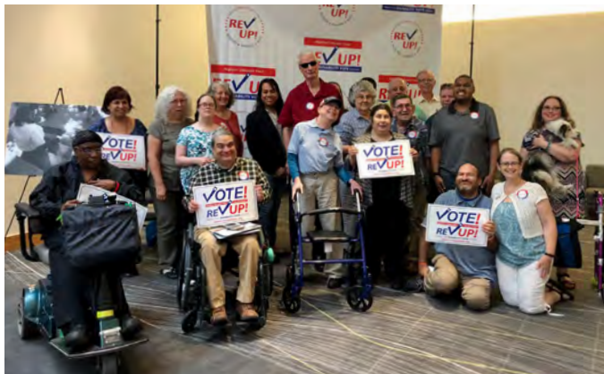
Our banner wasn't big enough for the San Antonio advocates who rode up for TDIF!