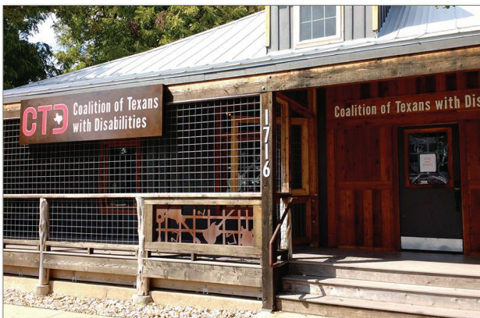
Our front porch and custom signage at our new home, 1716 San Antonio Street.